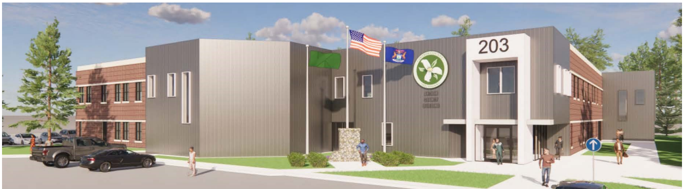
Renovated County Building Rendering: View from Cayuga St.